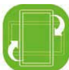
Landscape or Portrait